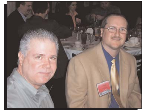
Are we having fun yet?