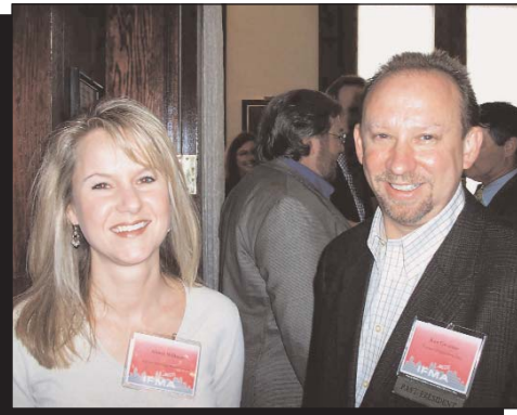
Smile, it makes people wonder what you're up to.