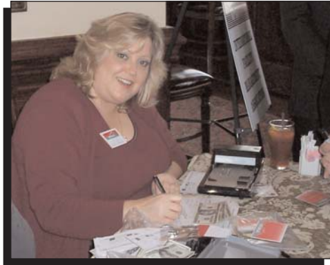
SHOW ME THE MONEY!!!