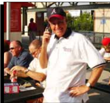
Can you hear me now?