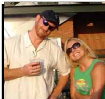
Ain't they cute?