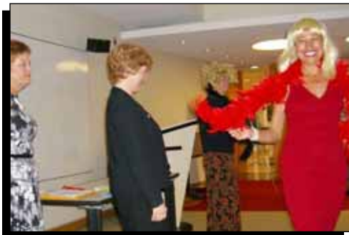
Is that Mae West or Mae East?