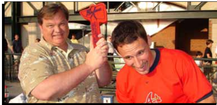
Monte puts new meaning to the phrase "Scalping for tickets."